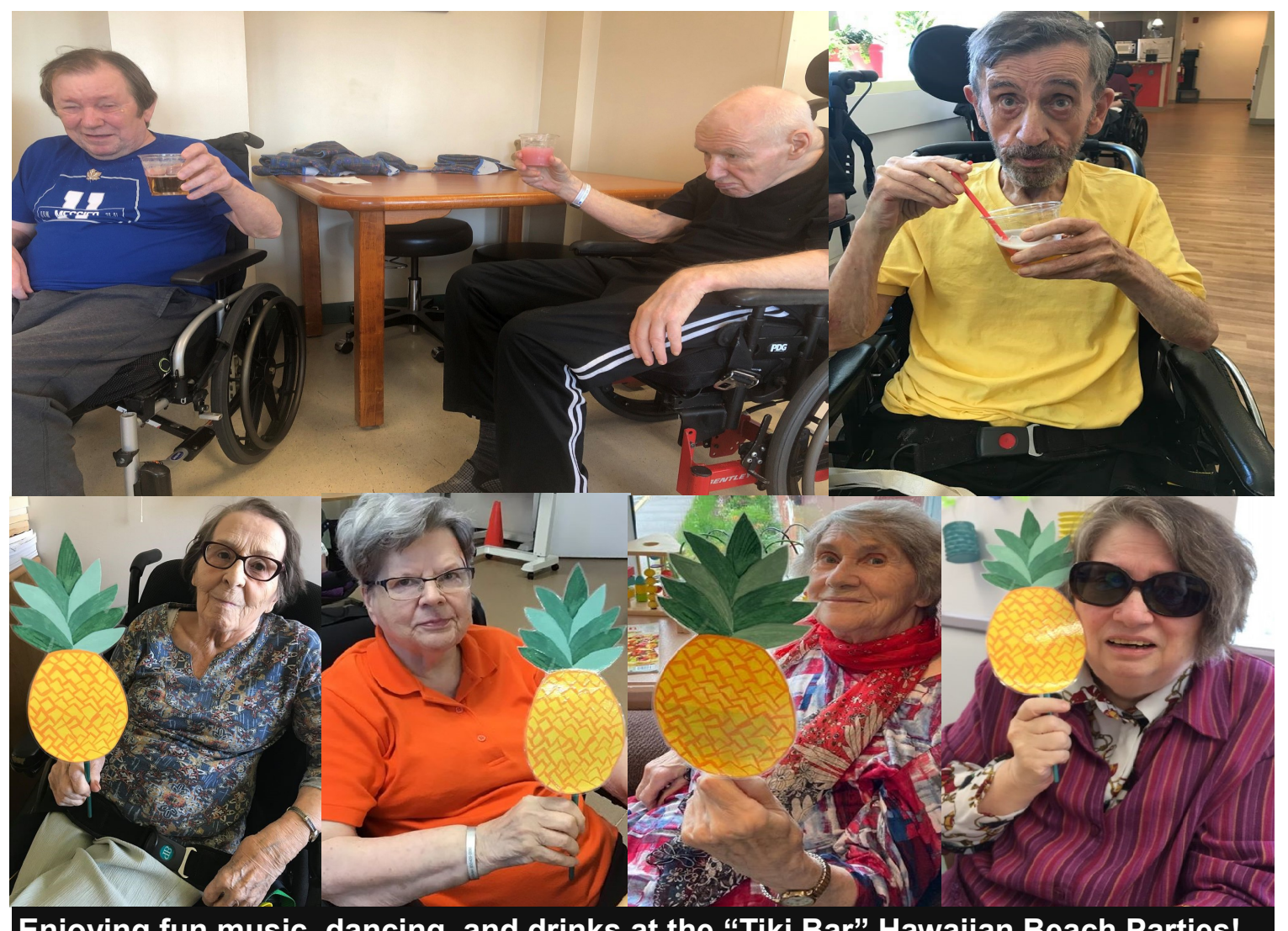
Enjoying fun music, dancing, and drinks at the "Tiki Bar" Hawaiian Beach Parties!