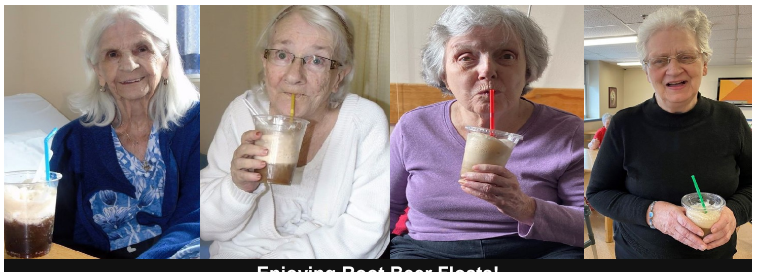
Enjoying Root Beer Floats!