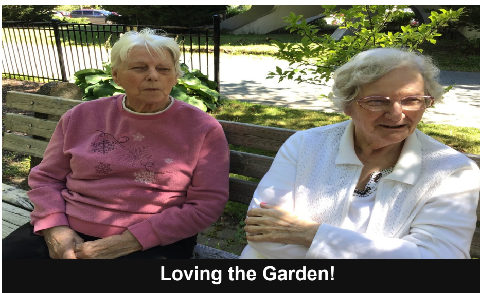
Loving the Garden!