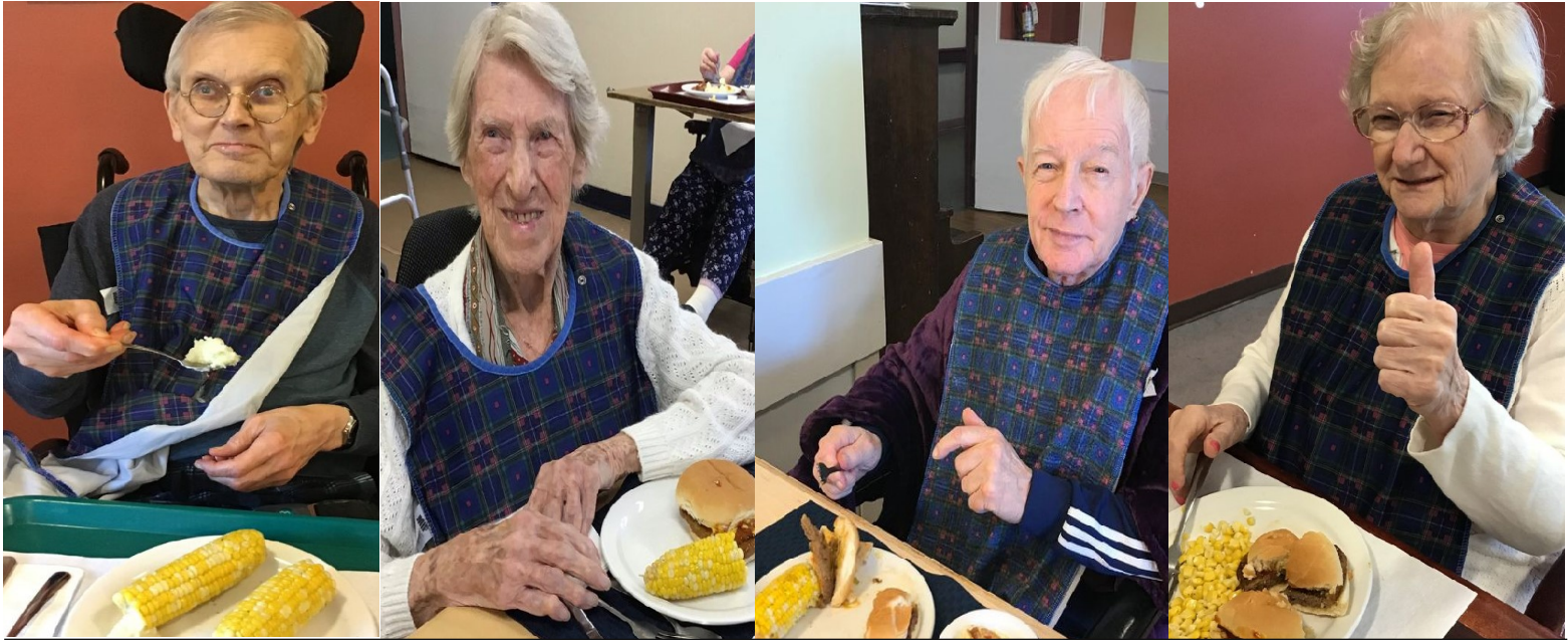
Enjoying the “food” of our labour: Corn shucking followed by a corn lunch!