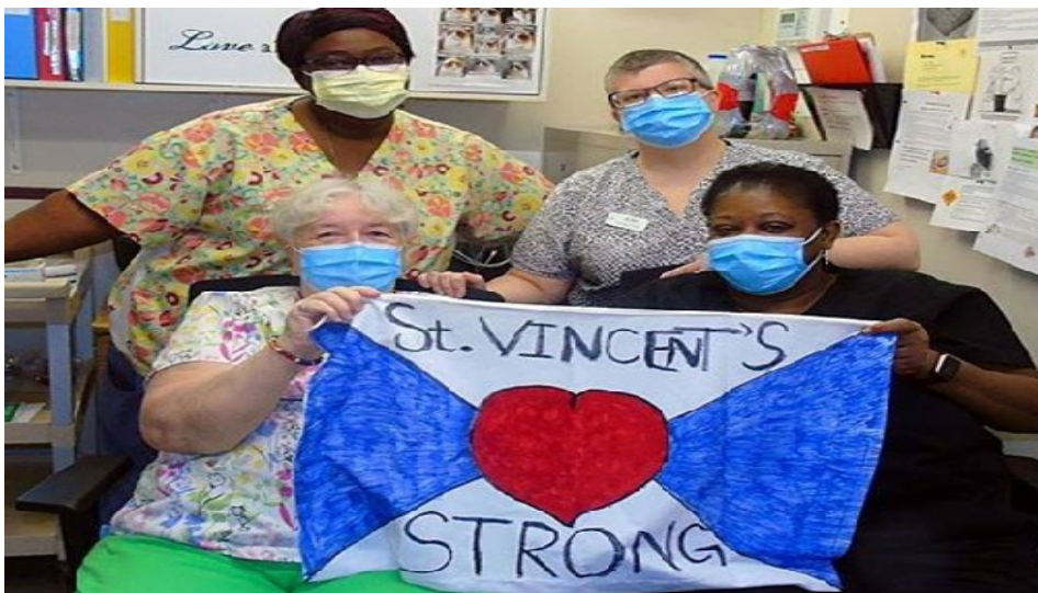
Staying safe, healthy and strong!