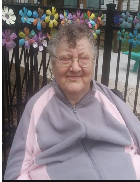
Touching up our "Perennial" Pop Bottle Flowers