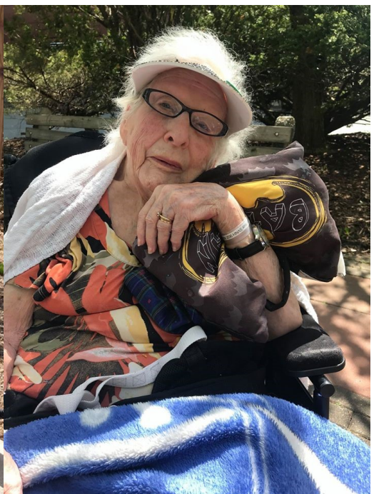
Enjoying the sun!