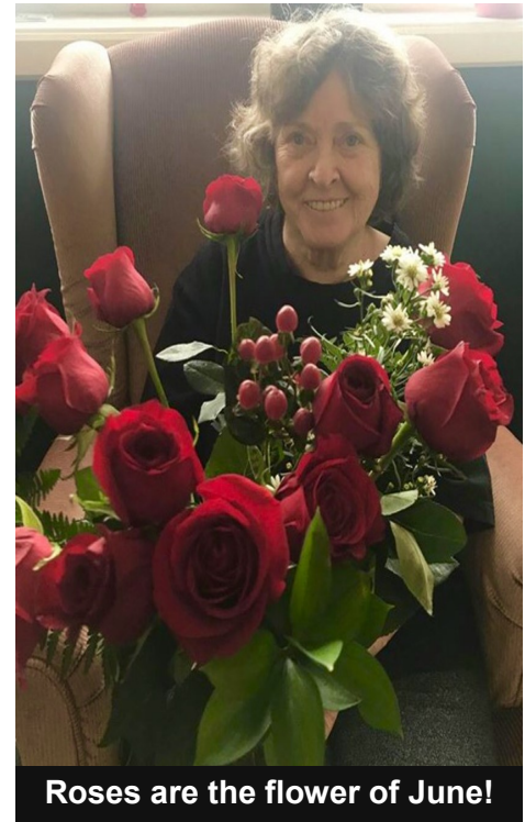
Roses are the flower of June!

The days are getting brighter, warmer and longer! And at Saint Vincent's we are staying strong! With summer on the horizon, we turned our attention to the great outdoors! Many residents began soaking in the sun and sitting in the garden. We started work on the garden, painted bird houses, rocks and got our "perennial" pop bottle flowers touched up! We also celebrated! The building was filled with flowers for Mother's Day, and we said a big "thank you" to our Nurses for National Nurses Week, May 11-17! We also kept connected. The Recreation team helped residents make over 250 video and phone calls to stay in touch and be Saint Vincent's strong!