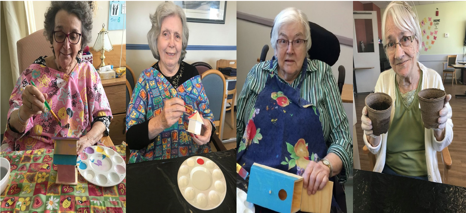
Painting bird houses and getting our vegetable seeds ready for the garden!