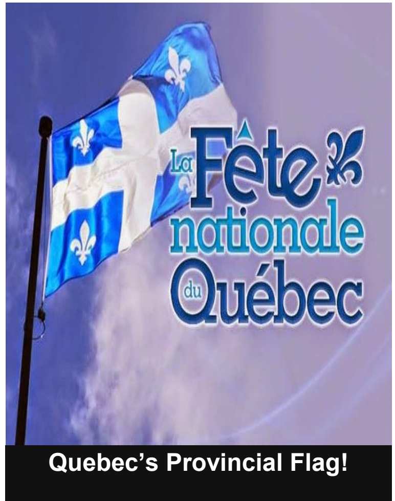
Quebec's Provincial Flag!