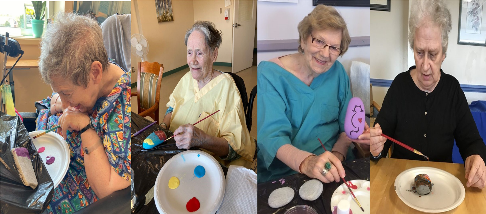
Our garden is going to Rock this year!