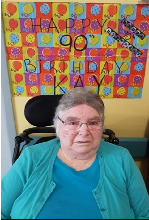
Milestone May Birthday!